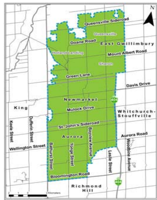
Upper York Sewage Solutions Service Area

Details are available at the project website: www.uyssolutions.ca